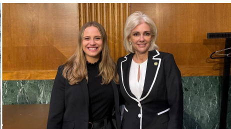
Left: PMHC volunteers gathered on the steps of Capitol Hill in Washington, DC for Advocacy Day 2026.