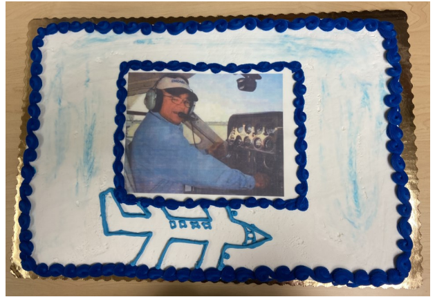
Cake provided by Leading Edge Flying Club