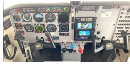
Engine Upgraded - Continental Platinum IO550-G7